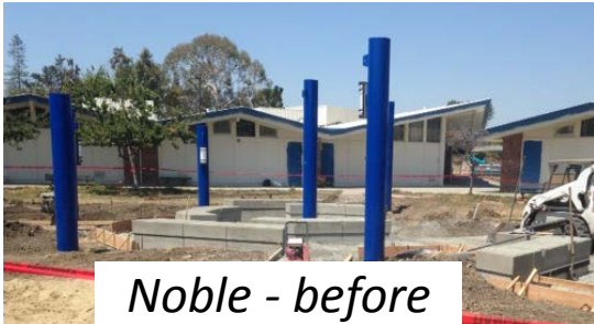
Noble - before